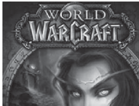
World of Warcraft is completely unknown by some, but for others, it's an addiction causing them to stare at their computers for over 50 hours a week.

that occurred in late June in Korea, when a three-month-old baby girl suffocated to death when she was left alone for hours while her parents went off to an internet café and played WoW .