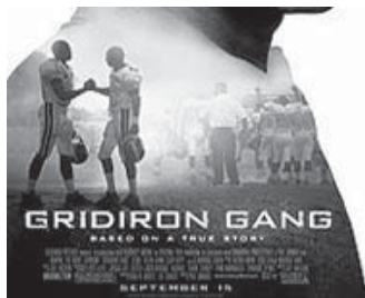
Can the Rock make a comeback in Hollywood with this inspirational film?