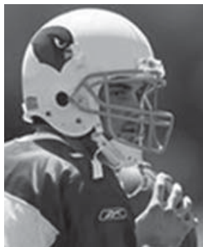
Matt Leinart drops back for a pass during the Arizona Cardinals' pre-season where he completed 29 of 47 total passes for 314 total yards.