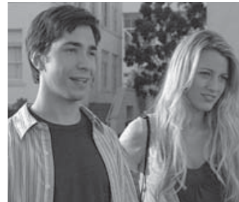
Justin Long, as Bartlby Gaines, teams up with Blake Lively in this teen comedy.

Welcome to South Harmon Institute of Technology, located right by its sister school Harmon. Or that's what Bartlby Gaines, played by Justin Long, would have liked you to think. When this teen didn't get into his 1st, 2nd, 3rd pick in college, or any of the colleges he applied to, he gave up. Until he got this great idea to open his own college until he got into a real school.