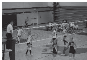
The MRHS varsity volleyball team started off a strong season by beating Long Reach High School.

Students believe that in the upcoming games there will be