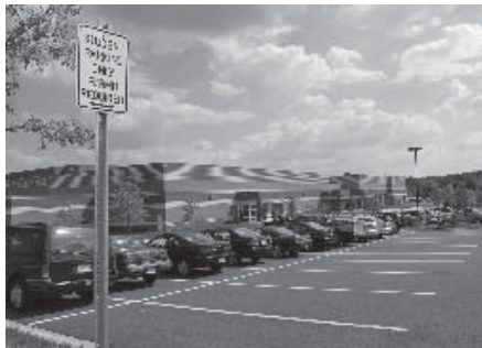
The parking lot slowly fills up as students begin to drive to school.

"If a student must go to his/her car during the school day, he/she must obtain permission from an administrator," says the Driving