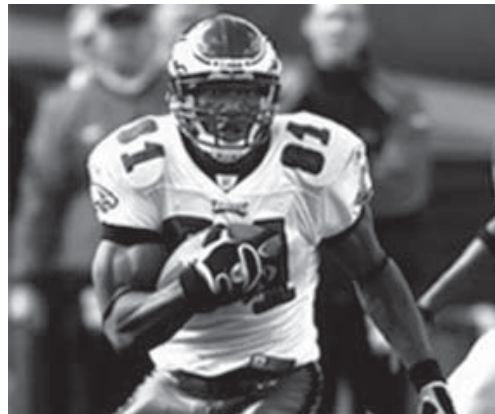
Terrell Owens claims that he was hospitalized for an allergic reaction to prescription pain medication.

responding and I know he is not feeling well, I used my judgment to call 911."