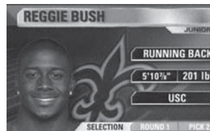
Reggie Bush was supposed to be the First Pick, but turned out to be second after Mario Williams.

"Leinart won't do anything with Kurt Warner starting ahead of him. Besides that, the Cards will do well with Fitzgerald and Edwards receiving and a good offensive line to create holes for the Edge at running back. They could definitely make the playoffs as a wild card," says