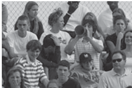
Marriotts Ridge students cheer enthusiastically in the stands of last year's MRHS Homecoming game.