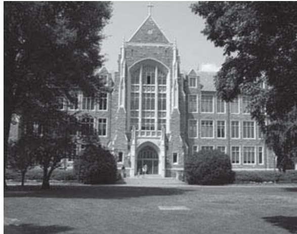
Students at Marriotts Ridge got a head start on college visits, stopping at schools like Georgetown University over spring break.